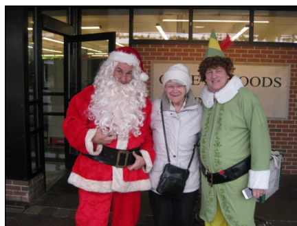
Shopper with Santa and Elf

We were joined this year by Santa and one of his elf's. Two Madison Junior High School Teachers who got their schedule mixed up. They stuck around for several hours anyway and we had a great time with them.