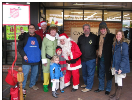
Everyone getting into the spirit of giving